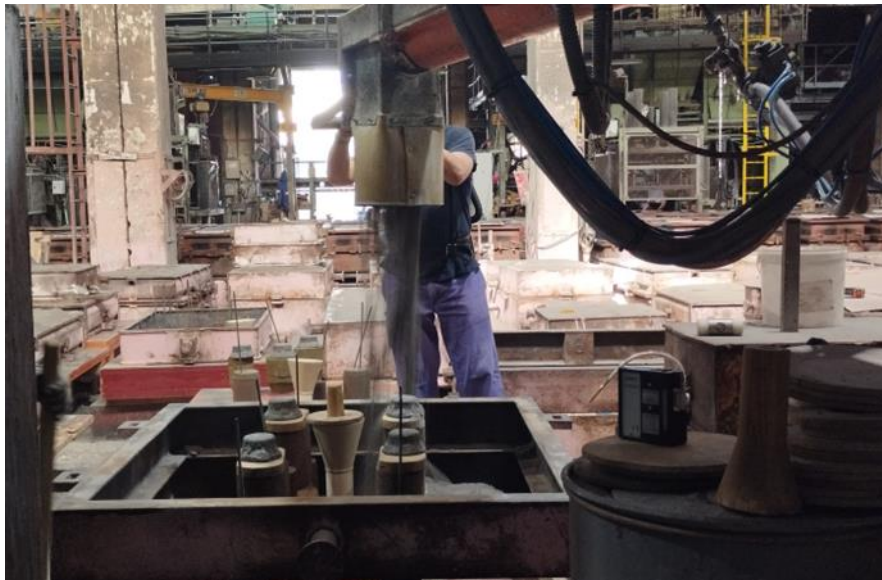
Figure 7. Pretests at metalurgica Madrilená Metamsa foundry in Spain.

METAMSA (Metallurgica Madrilená, S.A.) produces a variety of quality steel castings for Spanish and European customers. They already have experience with inorganic binders, as their molding line for castings weighing more than 80 kg has used a silicate (inorganic) binder system for years. Castings of less than 80 kg are made in green sand line. Metamsa's experiences and knowledge of inorganic binders are shared among the flagship foundries while they try to improve the behaviour of the inorganic line in cooperation with binder manufacturers and other project experts.