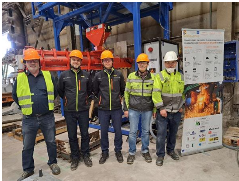
Figure 4. Pretests at Peiron foundry in Finland and the new mixer for the use of inorganic binder.

Peiron is an iron and steel foundry producing parts mainly for the producers of big industrial machines. Maximum casting weight is ca. 5000 kg. Peiron invested a continuous mixer line for the tests with inorganic binders. Peiron has already produced with this mixer ca. 15 tons of moulds and cores by using two no bake type inorganic binders. The casting quality has been comparable with the castings made by their current phenolic Alphaset moulding line.