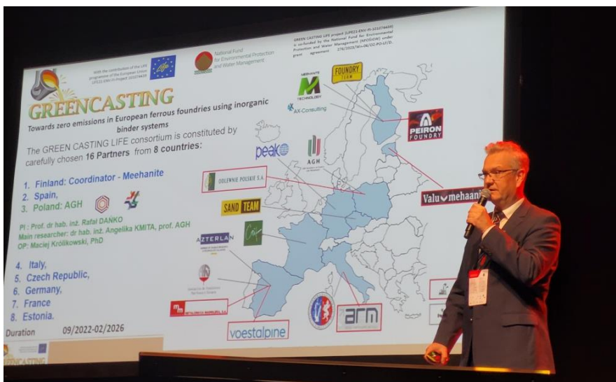
Figure 13-16. Green Casting Panel at IV International Conference of Casting and Materials Engineering ICCME 23 in Krakow, on 6-7.11.2023.

More information about IV International Conference ICCME 23 at: