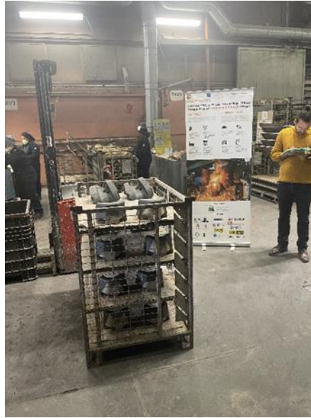
Figure 3. Cores made of inorganic binders at FA Fonderie di Assisi in Italy.

Peiron is an iron and steel foundry producing parts mainly for the producers of big industrial machines. Maximum casting weight is ca. 5000 kg. Peiron invested a continuous mixer line for the tests with inorganic binders. Peiron has already produced with this mixer ca. 15 tons of moulds and cores by using two no bake type inorganic binders. The casting quality has been comparable with the castings made by their current phenolic Alphaset moulding line.